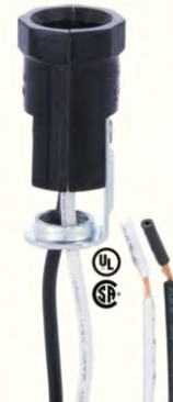
47635L42 - Phenolic pigtail E12 candelabra size lamp socket, 1/8F hickey, 1 3 / 4 " height, 42" length 105°C wire leads, 75W-125V Reg Each Each..... 48 Asst... 100 Asst.