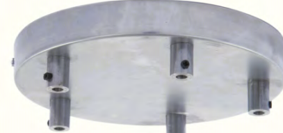
5-Port, Unfinished Steel 11721U