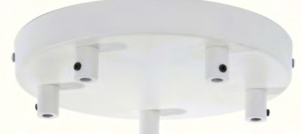
5-Port, White 11721W

USE New MULTI-PORT CANOPIES, MODERN STYLE SOCKETS, and OVERSIZED VINTAGE LIGHT BULBS to create an endless variety of custom light pendants.