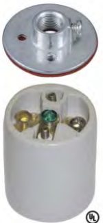
48303 - E26 Keyless Porcelain 3 Terminal Socket with Ground Screw, measures 1 1 / 2 " wide X 2 1 / 16 " tall. UL Listed. Comes with 1/8 IP threaded metal cap. 660W-250V Reg Each.. Each..... 48 Asst.... 100 Asst...