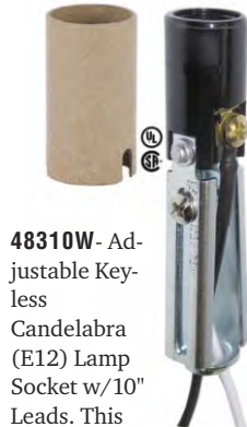
48310W - Ad-justable Key-less Candelabra (E12) Lamp Socket w/10" Leads. This handy socket adjusts from 3 1 / 4 " to 4 3 / 4 " in height, and comes with insulated stranded wire leads that are connected to the socket terminals via sturdy and safe copper lugs . Socket is U.L. and CSA Listed. 10" wire leads are 18 1/32 AWM 105°C plastic covered single strand wire. 2-leg hickey is tapped 1/8 IP. Reg Each Each..... 48 Asst... 100 Asst.