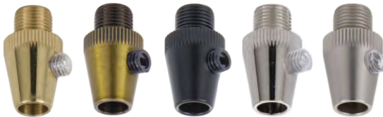
Pol. Brass Ant. Brass Black Nickel Satin Nickel

Metal cord grip bushings with plastic set screw for PVC and cloth covered (SVT-2 & SVT-3) round lamp cords. .293" inside diameter, 1 1/16" length. These bushings are a perfect complement for socket-cord type pendants. Assort Cord Bushings Only