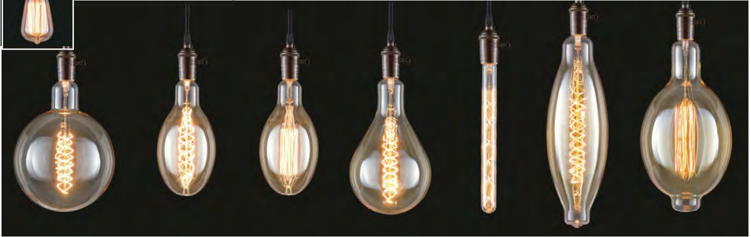
47205 - G200 style, 60W. 11" x 7 7 / 8 " E26 base, spiral filament.

SIZE COMPARISON to regular Edison-type bulb (our #47094, p. H-95 in Hardware catalog)