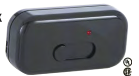
Black LUTRON In-line Slide dimmer switch for table lamp, 300W, 120V, for SPT-2 wire only Reg Each Each.....