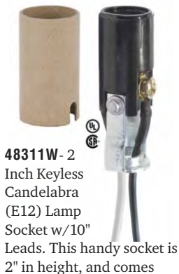
48311W - 2 Inch Keyless Candelabra (E12) Lamp Socket w/10" Leads. This handy socket is 2" in height, and comes with paper insulator and insulated stranded wire leads that are connected to the socket terminals via sturdy and safe copper lugs . Socket is U.L. and CSA Listed. 10" wire leads are 18 1/32 AWM 105°C plastic covered single strand wire. 2-leg hickey is tapped 1/8 IP. Reg Each Each..... 48 Asst... 100 Asst.