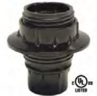
47646 - European style, 4-piece E12 Candelabra Lamp Socket with full UNO thread and ring, 1/8 IP base, and Euro-type screw terminals. 75W-125V Reg Each Each..... 48 Asst... 100 Asst.