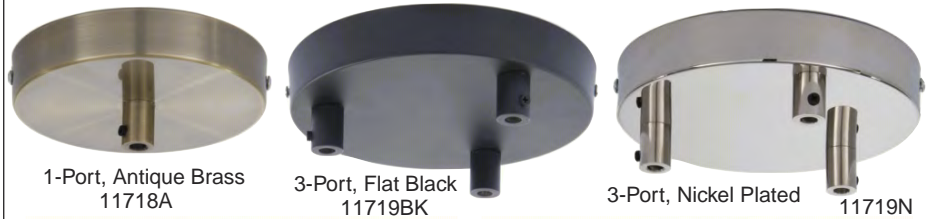
1-Port, Antique Brass 11718A